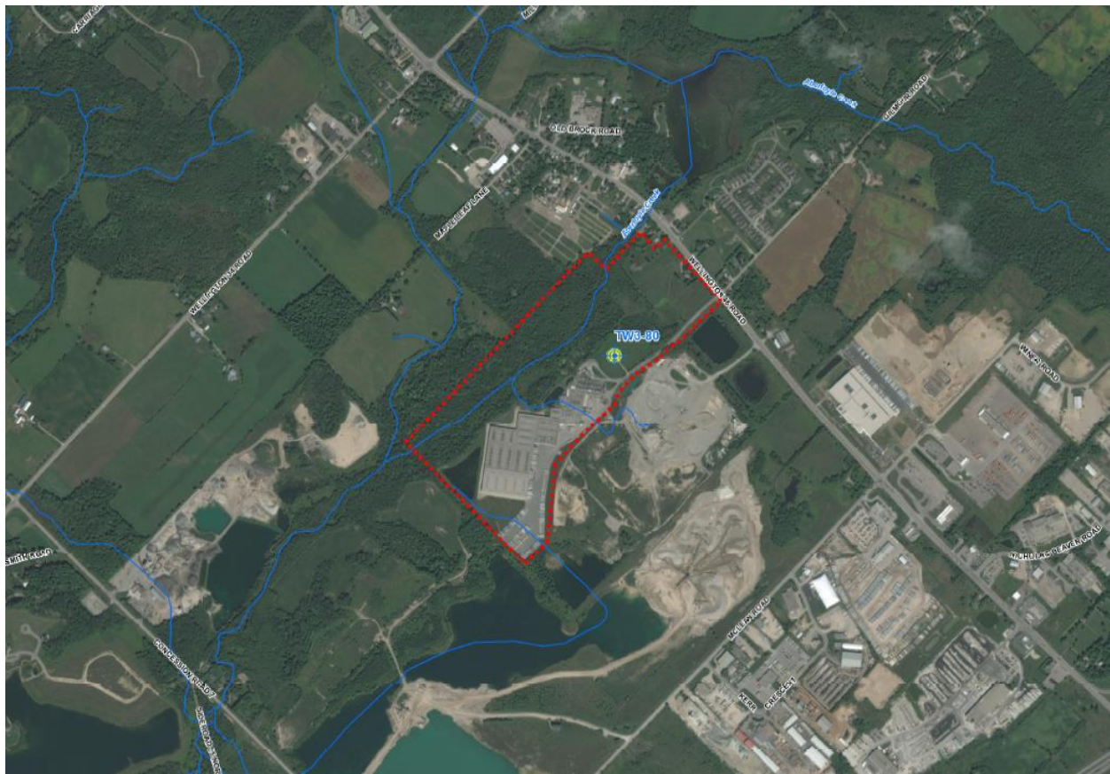
Figure 1. Nestlé Property in Puslinch

The water taking is governed by a Permit to Take Water (PTTW) issued by the Ontario Ministry of the Environment and Climate Change (MOECC) which allows the company to withdraw up to 2,500 liters a minute. The current permit will expire on July 31, 2016. Nestlé Waters Canada submitted a permit renewal application for well TW3-80 to the MOECC on April 11, 2016. The application seeks the same withdrawal limits as the current permit for a period of ten years, through 2026.